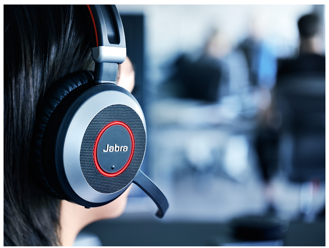
The red busy light on Jabra's headsets for open offices are developed to eliminate distractions created by noise and interruptions.