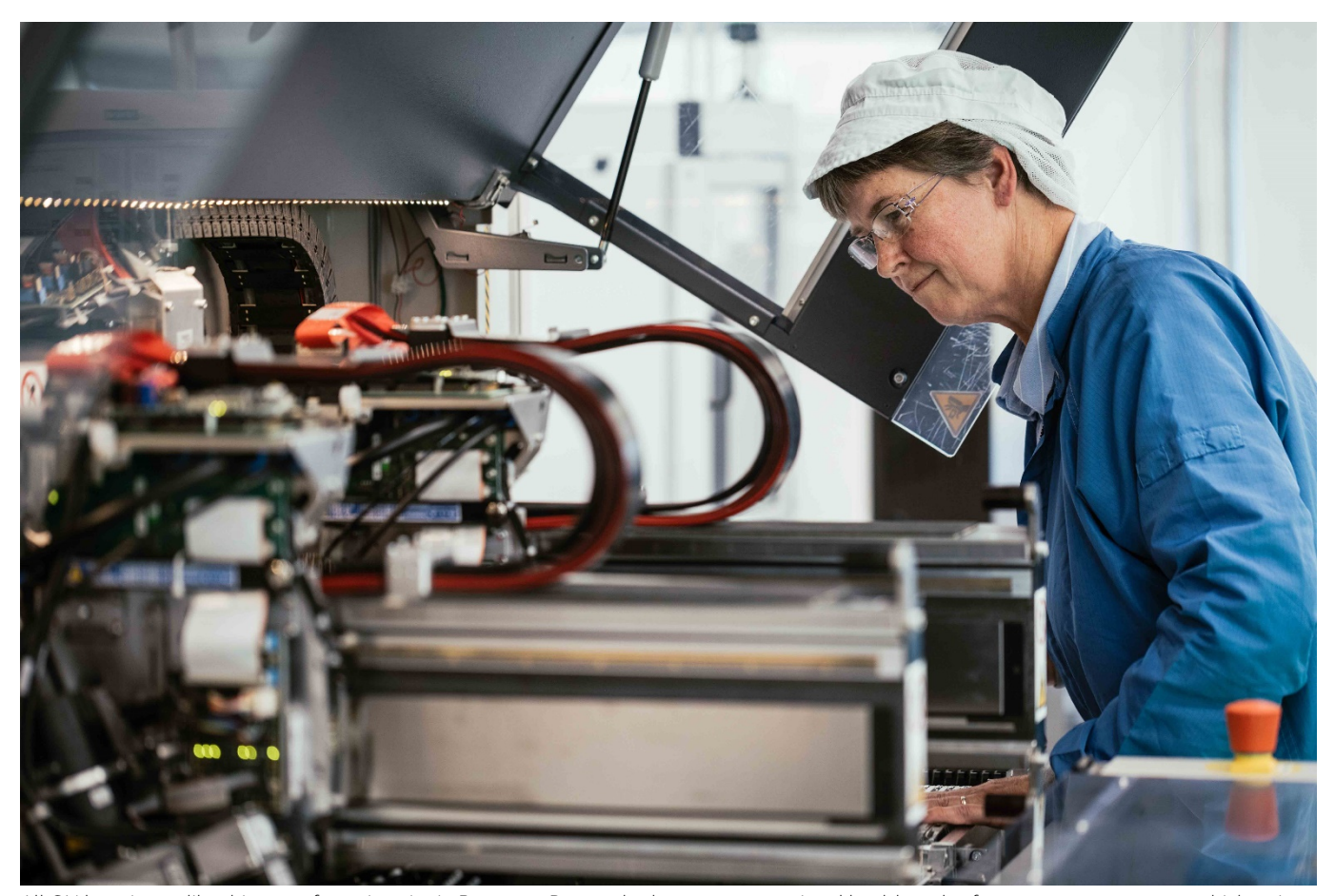
All GN locations – like this manufacturing site in Praestoe, Denmark – have an occupational health and safety management setup which strives to prevent accidents.

In 2020, we will continue to strengthen data protection to provide the best consumer experience in a trustworthy and secure way.