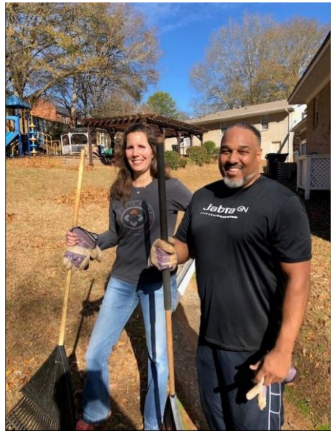
Throughout North America, GN Audio in North America – under the banner of the Jabra brand – had approximately 100 volunteers participate in the second Annual Day of Giving.

Throughout North America, Jabra had approximately 100 volunteers participate in the event, as well as over 465 volunteer hours pledged to a variety of charities ranging from ani-mal rescue shelters, homeless shelters, and food banks. Several thousand meals were prepared, and packed, and countless gifts were wrapped and ready to be delivered to families in need.